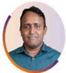
Lakshmikant Hari Centre for Sustainable Development, KJ Somaiya Institute of Management, Mumbai