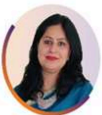
Shuchita Singh Centre for Sustainability, GL Bajaj Institute of Management Research, Greater Noida