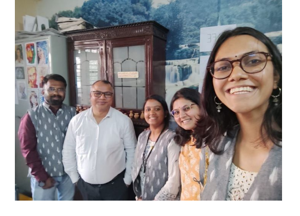
PGPDM alumni met in Pune on March 22nd, 2024