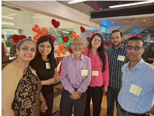
The Bangalore meet was held on 14th February, 2024.