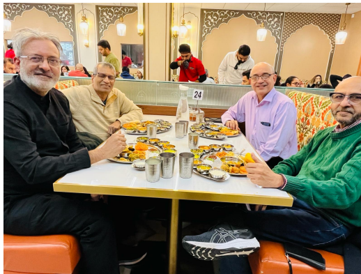
Alumni from Class of 1983 met in Mississauga, Canada on February 18th, 2024, for a lunch and coffee gathering.