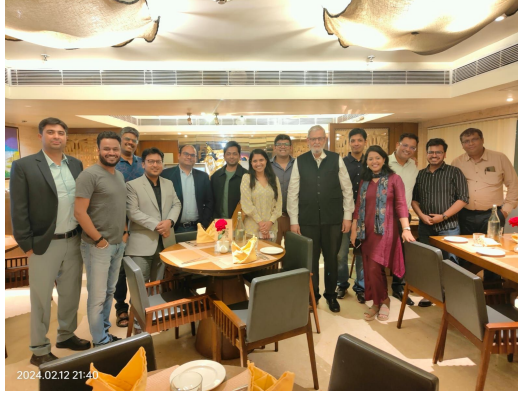
The Kolkata meet was held on 12th February, 2024.