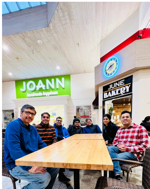
Seattle-based alumni came together on December 10, 2023