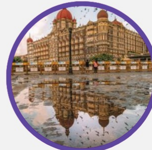
Mumbai 21st Feb, 2024

SPJIMR PGDM admissions are scheduled in person at Mumbai, Delhi, Kolkata and Bangalore after a gap of 4 years. Many of our faculty members are travelling to these cities. As always, we are also hosting an alumni meet taking advantage of our faculty members presence in these cities. It is a great opportunity for you to meet faculty members and fellow alumni in your own city.