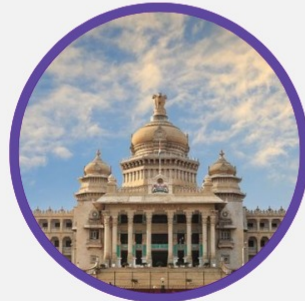
Bengaluru 14th Feb, 2024