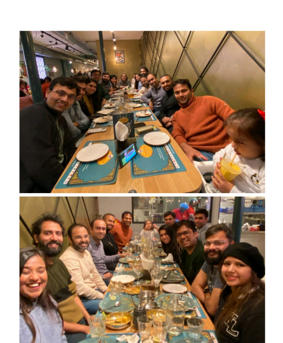
Alumni in Netherlands get together on November 18, 2023.