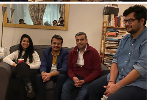
United Kingdom based alumni meet up on November 16, 2023